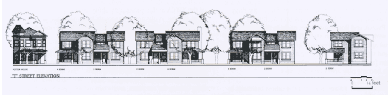
Southside Park Cohousing – Sacramento, CA - www.designadvisor.org Exhibit II